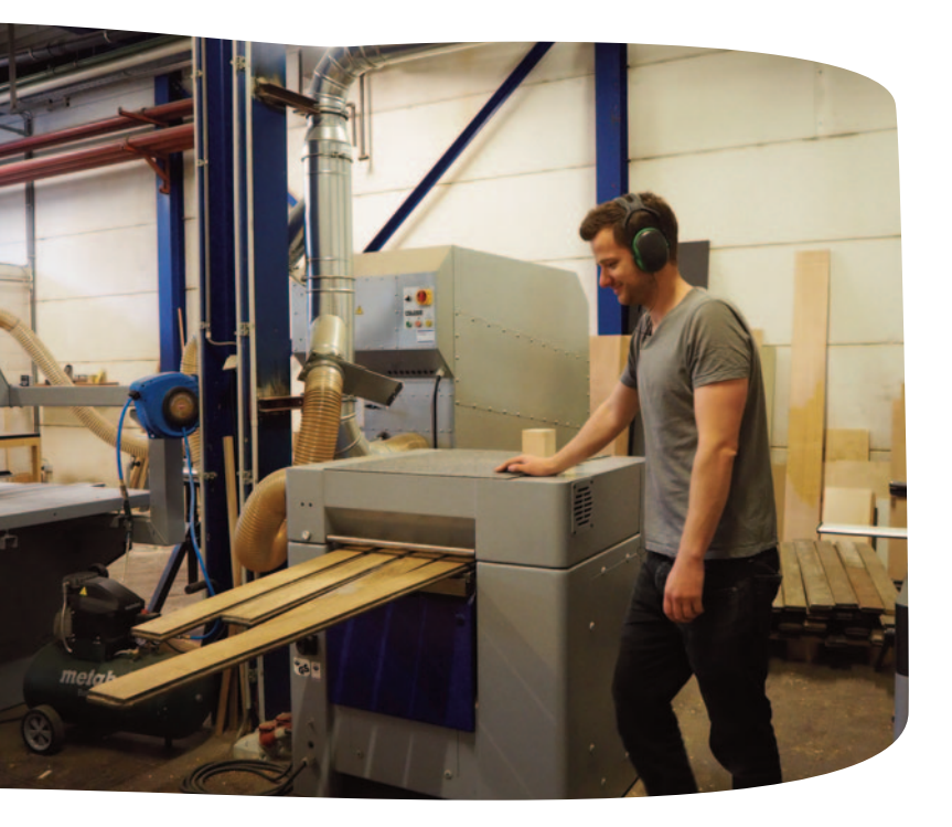
A great example of deformation for reuse is routing old hardwood flooring planks in order to homogenize their widths and for ease of reinstallation. Woodworkers is a workshop in Brussels specialising in furniture (https://www.woodworkers.be/).