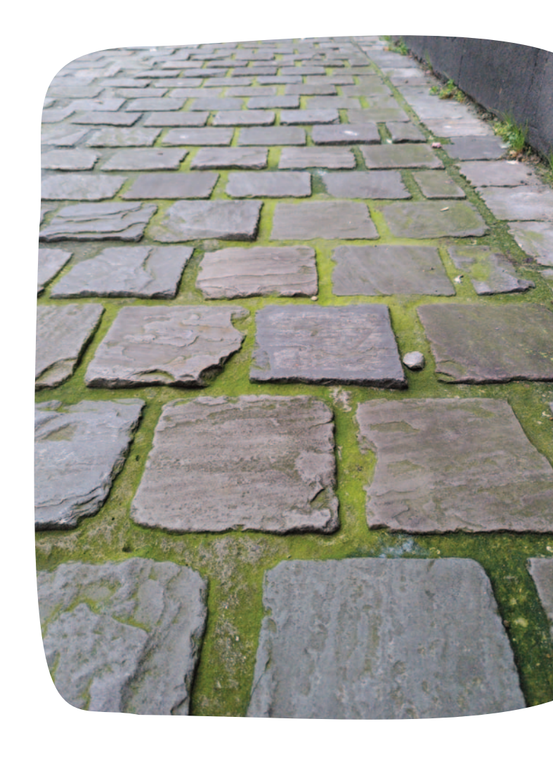
Moss growing in between cobblestones

There are anti-green agents both toxic and less toxic, which may also damage the surface or structure of any given material. There are existing examples of some unprecedented beauty in every city with some form of biological growth. In Brussels we have paved streets, the joints of some streets are vibrant green, giving some areas of the city a surreal glow which can be admired by anyone walking along the streets. It is uncommon to magnify used surface conditions in stone, but why not change this thinking and explore possibilities of embracing a bio-patina?