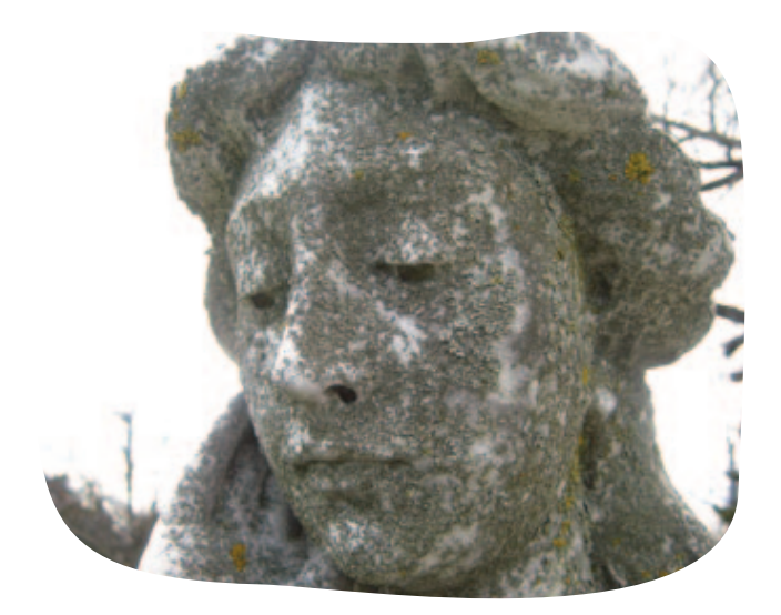
Lichens growing on a stone sculpture in a cemetery.

understanding lichens and other biological growth which may allow for a symbiosis, and protection from, rather than invasion of the elements. There are some studies which support this hypothesis. Results from the comparative analysis of the water transport data on a temple located in Angkor Wat (Cambodia) suggested that lichens had an important moisture-controlling function for the environmentally stressed stones [1]. Lichens are also a good indicator of air quality and can help determine historical timelines of specific sites as they grow roughly 3mm per year.