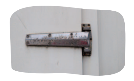
The chrome from this exterior door's hinge has been attacked by the elements

Hardware can be the design cornerstone of any room while also going unnoticed. Most commonly made with some kind of metal, hardware can range from legs and feet to hinges, door knobs and handles, and even decorative screws. All of which are in one way or another finished.