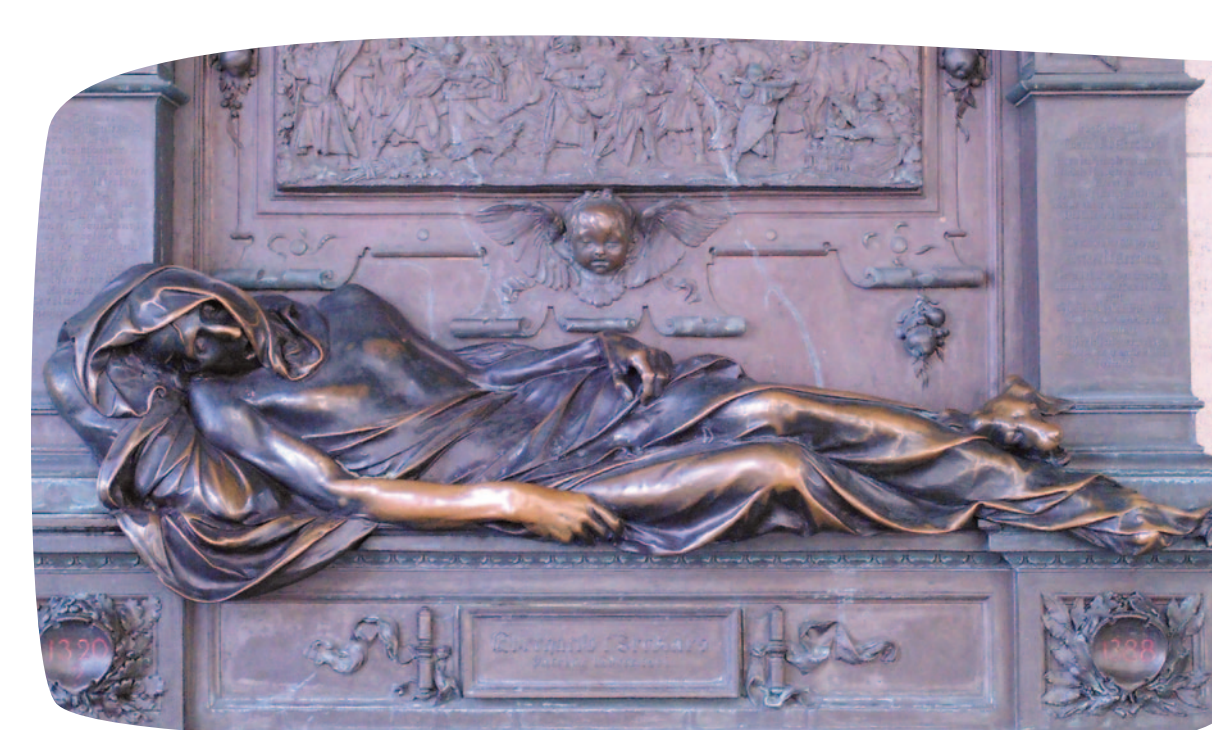
Bronze sculpture discoloration from touch

Patina is thus unique to each material. When feasible, it should be preserved.