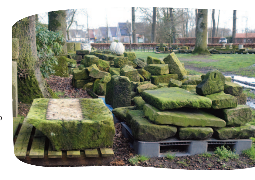
Stone found at the Orimenta yard (www.orimenta.nl)

For historical preservationists biological growth is unwanted because it may accelerate decomposition or degradation of a stone construction. There are undoubtedly some invasive types of biological growth which embed their roots into the very structure of the stone through crevices, joints, or cavities, accelerating erosion. There is however some due diligence in