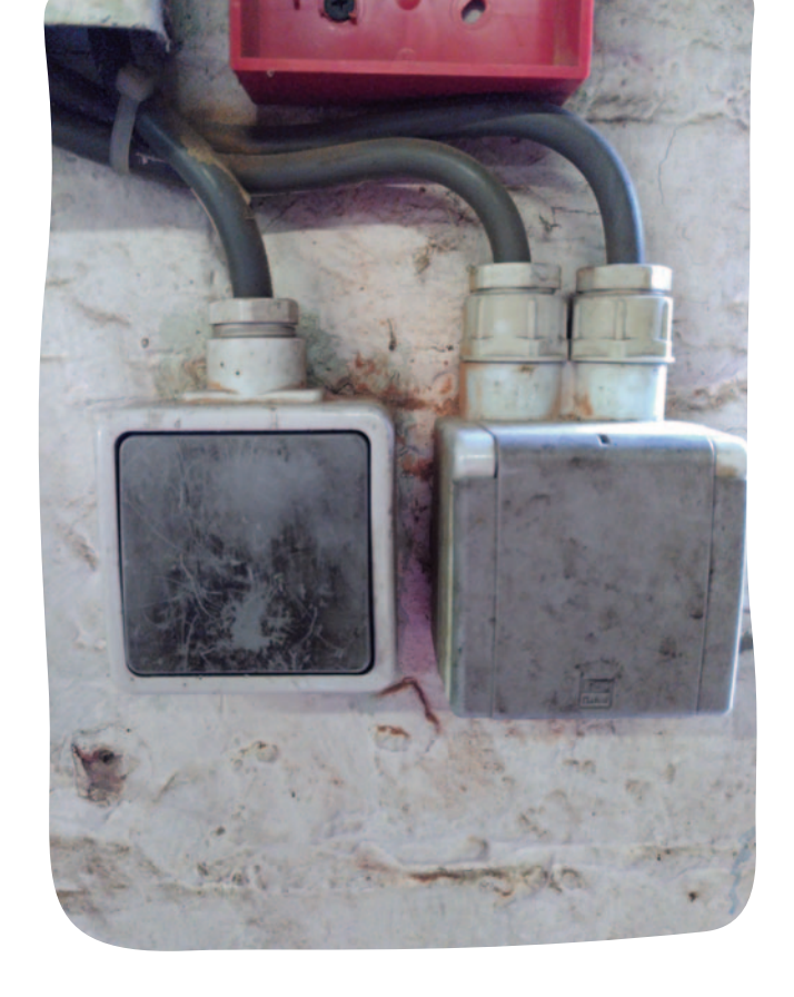
signs of use on a light switch

A surface finish can be both aesthetic and practical of course. Additive surface treatments may depend on the reclaimed material's new use. If a surface is meant to be gripped then a rougher surface is desired. A protective finish may result if the surface will experience higher user traffic than its previous installation. New uses may sometimes require specific characteristics to be met before installation, for example to make a surface easier to clean, more durable, or resistant to certain elements to avoid abrasion.