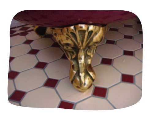
Re enamelled foot bath detail

There are hundreds of types of metallic hardware pieces in our everyday life as we interact with different rooms and passageways in the buildings we roam. Many of these gems go unnoticed. Did you notice the feet on the re enamelled tub in the previous section?