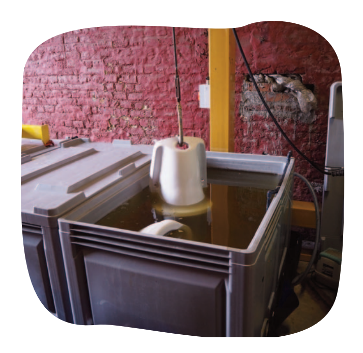
Urinals soaked in acid bath for a deep clean

close the loop. For now, there are tons of resellers who have at least a small section of reclaimed sanitary components, in the UK for example there are specialist dealers focusing on sanitary ware waiting to be reused!