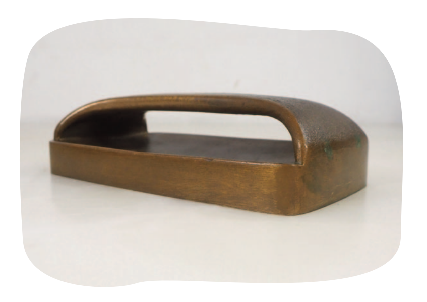
1974 Brass door pull by Jules Wabbes from the Generale de Banque headquarters in Brussels

On a more practical level there are chemical transformations some metals can go through to create a stronger, more resistant object. To prolong life and protect against rust, steel galvanising is a long practiced procedure to give steel a protective coating usually with zinc. The corrosion first occurs on the zinc coating and then starts attacking the main steel structure. This process can be re-done to reinforce steel once more. Chrome has also been used as a protective finish in metal hardware, while even trendier now is the black matte protective finish giving stainless steel accessories (especially in bathrooms) a neutral look to combine with other design aspects.