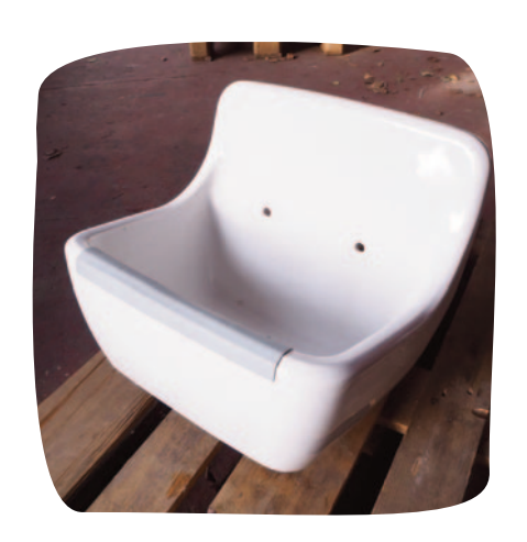
Reclaimed bucket sinks before and after cleaning