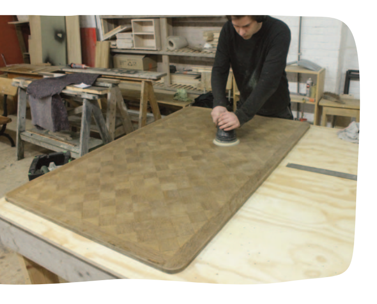
Recup Design Workshop, sanding wooden surface

various levels of toxicity and strength, which for the sake of the environment and personal health we discourage the use of. Instead of erasing traces of wear, embracing such characteristics can add a lot to the quality and the meaning of the design.<sup>1</sup>