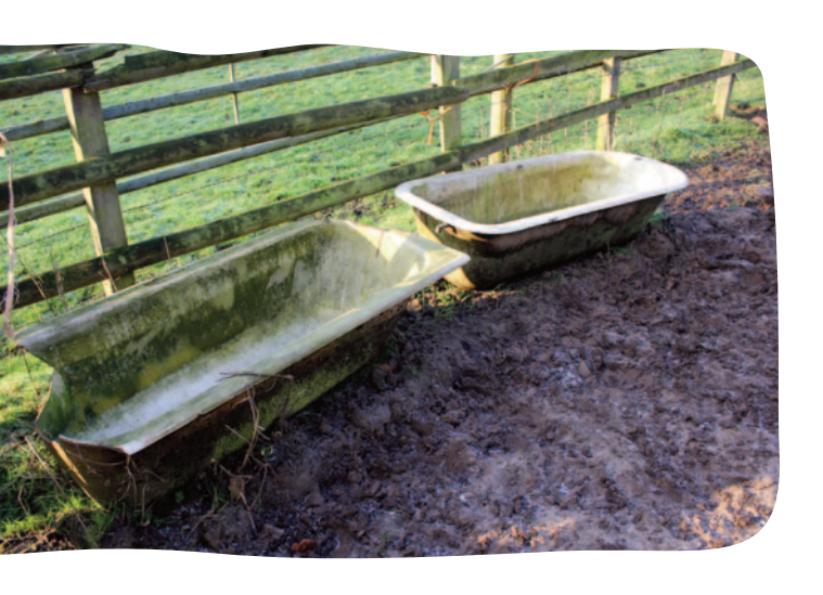
Abandoned bathtubs

In contemporary production, porcelain components are vitrified to make their surfaces non-porous and therefore resistant to water, which is the element these objects are most in contact with. While most used porcelain sanitary components will have some sort of buildup, it is not difficult to clean the surface back to a shiny white. Water can cause limescale buildup, especially with leaky faucets or standing water left behind in a building that is bound to be demolished, or redeveloped.