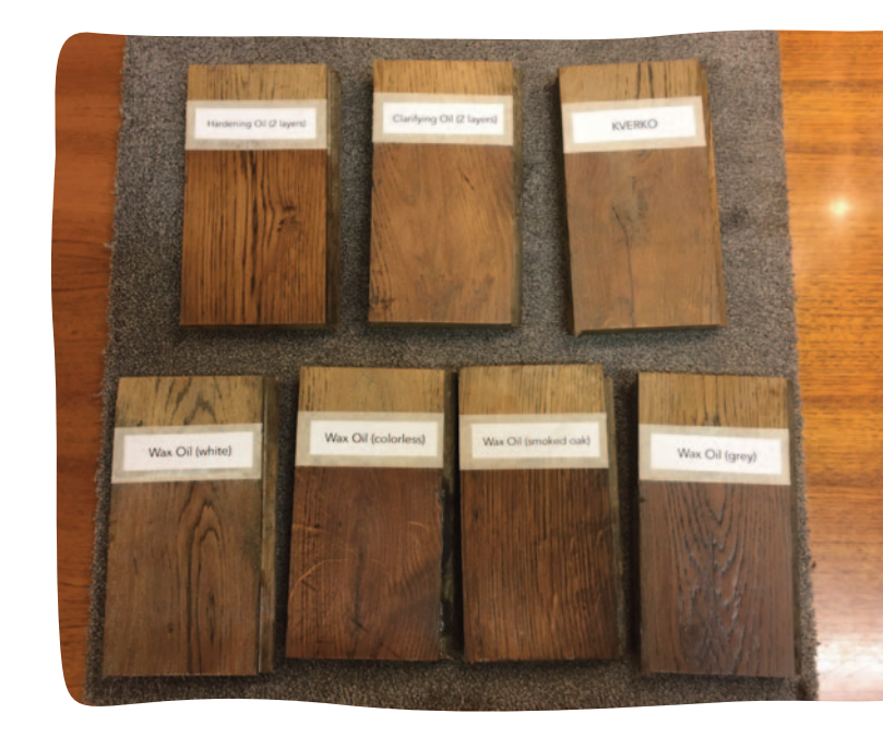
Oil treatment samples

Before any structural transformation is done, cleaning should always be the first choice, and sometimes final treatment a reclaimed material undergoes. This subtractive treatment is simply the gentle removal of dirt, grime or dust by using basic soap and water when possible. Sometimes just water can do the trick. Heavier duty cleaning products may include degreasers at