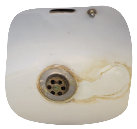
Lime build up on reclaimed sink

Normally, for small surface stains, a simple baking soda and water or vinegar solution and some elbow grease can do the trick. In order to clean the interior surfaces and achieve a like-new functioning toilet or urinal, there must be a more robust procedure. A light acid bath over a period of time dissolves any built up limescale, and after a power wash rinse you are all set. Please mind that such a procedure is more complicated than this simplified description. Some cleaning procedures are not ideal however. As we learn with a large batch of sanitary elements unmounted from a large building in the center of Brussels, this procedure is not economically interesting.