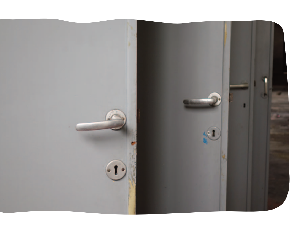
Paint layers on doors chipping away, being painted, and then chipping again, or repainted.