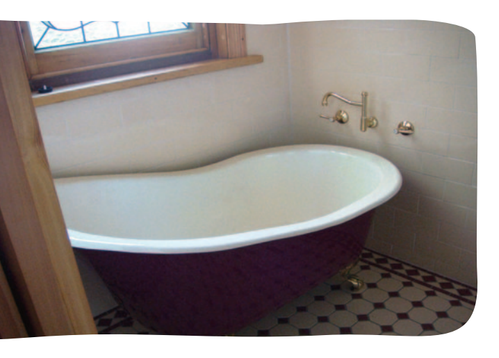
Re enamelled foot bath