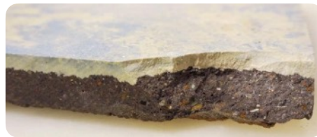
Two-layer 'cement' tile