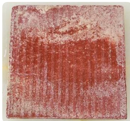
Single-layer 'cement' tile - Back Side