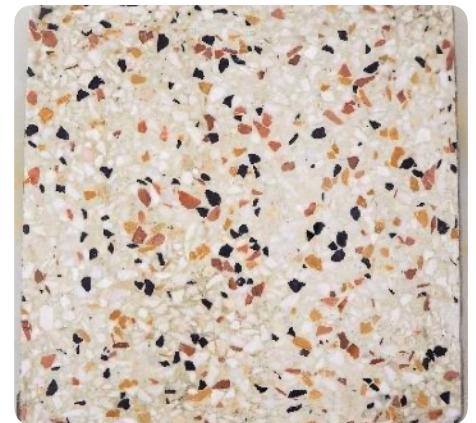
Two-layer 'terrazzo' tile - Front side