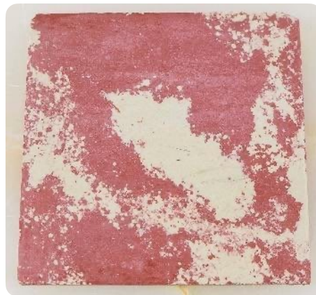
Single-layer 'cement' tile - Front Side