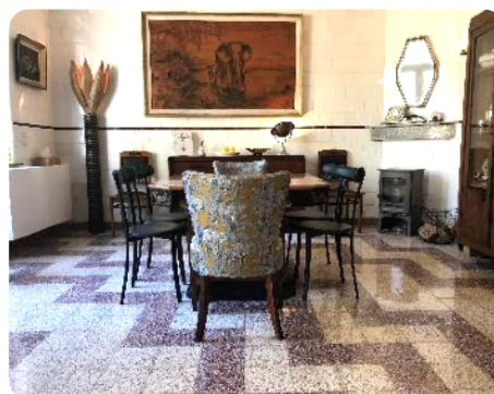
Reused tiles (BE)