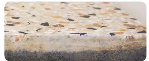
Two-layer 'terrazzo' tile - Edge