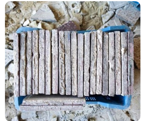
Few mortar remains after removal (hybrid mortar)