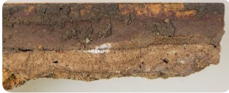
Mortar remains on edges and back side

Cement-based tiles are often found as flooring in existing buildings. Their recovery is not always easy but can nevertheless represent a great opportunity for reuse, either on-site or via the professional channels of material resellers.