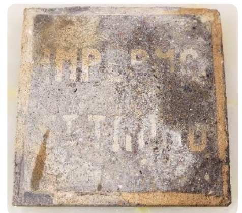
Two-layer 'terrazzo' tile - Back side