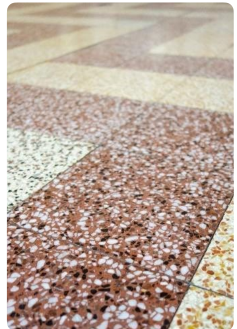
Tiles before reuse

To increase the chances of meeting the offer available on the reclamation market, the designer/specifier can choose to split large surface areas into smaller quantity batches (for example, by providing different patterns in each room).