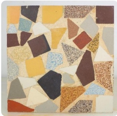
Terrazzo tile whose aggregate is made up of offcuts of porcelain stoneware tiles

The aggregates used in the manufacture of terrazzo tiles can constitute up to 80% of the finished product, and can be siliceous in nature (quartz, quartzite, granite, porphyry, sand, etc.), or limestone (marble, limestone, dolostone, etc.). The dimensions of the aggregates vary according to the desired rendering. The resistance of the wear layer strongly depends on the degree of hardness of the aggregate used. These aggregates are generally by-products of stone extraction, the glass industry or even ceramic tile fragments, which thereby find interesting outlets.