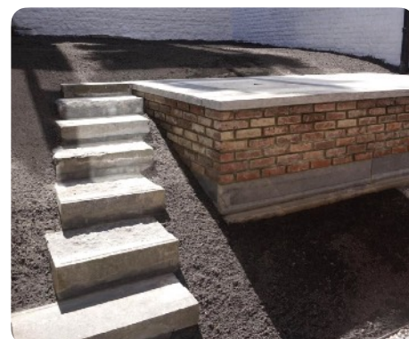
Blue stone exterior coping stones reused for the creation of a terrace, Brussels (BE) © VLA architecture https://www.guidibatimentdurable.brussels/fr/reemploi.html?DC=10994