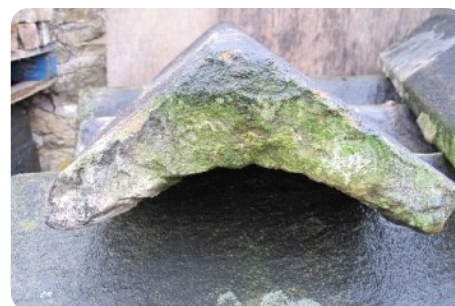
Cap coping