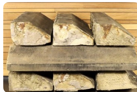
Sloped surface coping