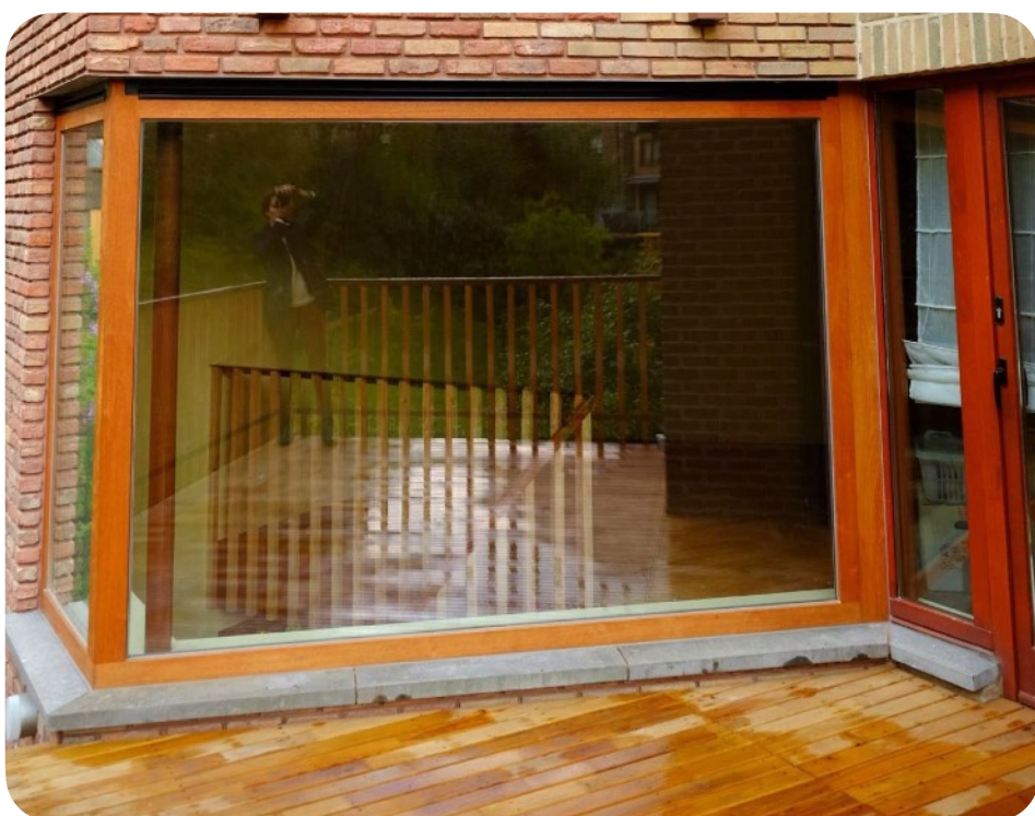
Reusing old coping stones for window sills