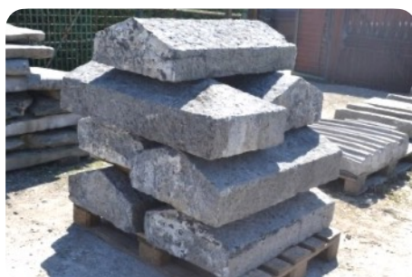
Reclaimed blue stone (limestone) coping stones