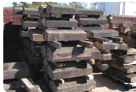
Reclaimed granite coping stones