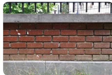
Coping stone (with overhang)

Most of the reclaimed building materials are sold as is. The conditions of sale may however contain special guarantees specific to the material. Some suppliers are able to indicate the origin of the material and/or provide documentation on the product purchased (for more information, see the Introductory sheet).