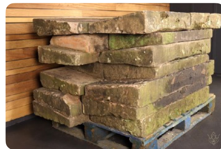
Development of organisms

→ Storage and packaging. Coping stones are generally stored outside, packaged and strapped on pallets. They are arranged horizontally. Ideally, they are separated by wedging elements in order to limit the risk of damage. The wedges/separation wood must not be treated, be very dry and not contain tannins which could stain the stones. Metal straps should be avoided as there is a risk of staining the stone (rust). The packaging must take into account the large mass of the elements. Appropriate means of transport and lifting are also required.