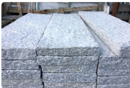
Flat wall coping

Did you know ? A coping is a construction element that lays on top of a wall and comes down the sides of it, encasing the wall and providing weather protection. However, a caping sits on the wall with its edges flush to the width of the wall.