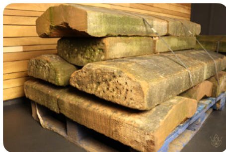
Reclaimed red sandstone coping stones

When a re-machining of the reclaimed coping stones is envisaged (sawing, squaring, milling, etc.), this will generally modify the appearance of the visible faces.