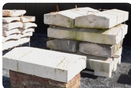
Reclaimed white stone (limestone) coping stones © BCA Matériaux Anciens