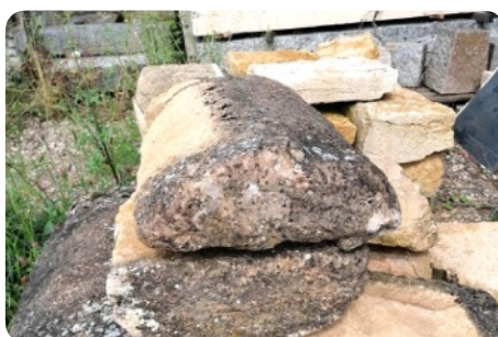
Half round in yellow Brionnaise stone