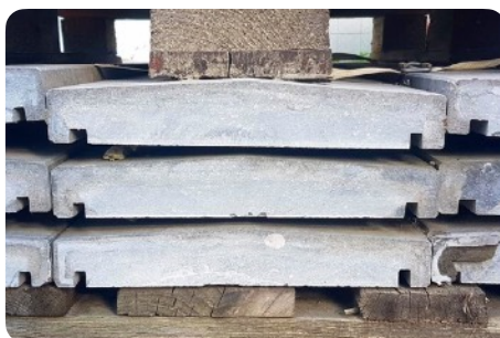
Double inclined surface coping