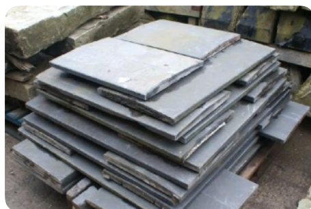
Reclaimed slate coping stones