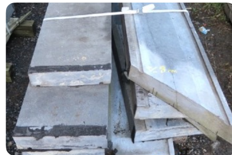
Sealant and tar residues

These various operations can be carried out by specialised resellers within their facilities. They can also be considered on site, provided that the site logistics allow it.