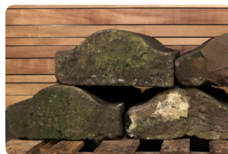
Coping stone