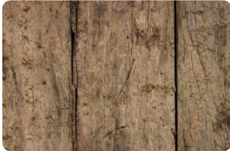
Appearance of ship's timber

Ship's timber (in Dutch: 'scheepsplanken', 'scheepsvloer' or 'scheepshout') is a salvaged material found mainly in Belgium and the Netherlands. It comes from the dismantling of port and maritime structures such as pontoons or barge holds.