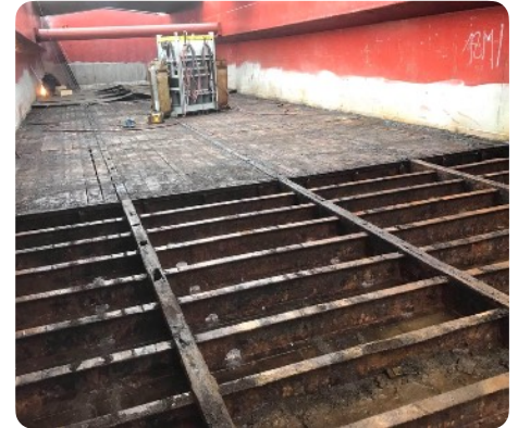
Dismantling of barge holds

→ Condition: Planks must be free from mould. The degree of wear and traces of use can vary greatly from batch to batch.