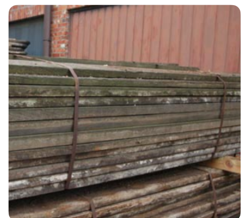
Outdoor storage