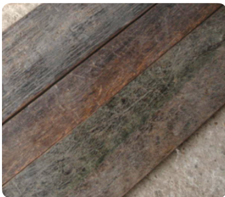
Untreated boards

Ship's wood planks have generally withstood many years of use and are generally less prone to deformations (sagging, warping, etc.) than their new wood counterparts.