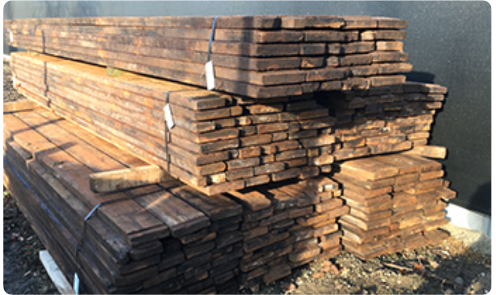
Outdoor storage

They are widely used for exterior applications such as patio floors, fences, palisades, wooden shelters, outdoor furniture, retaining walls, etc. They are occasionally found in interior use as flooring or panelling.