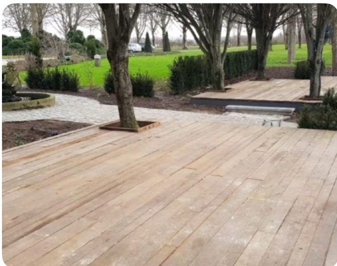
Terrace application