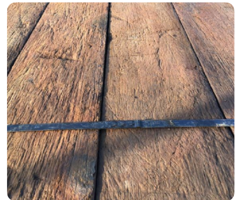
Brushed boards